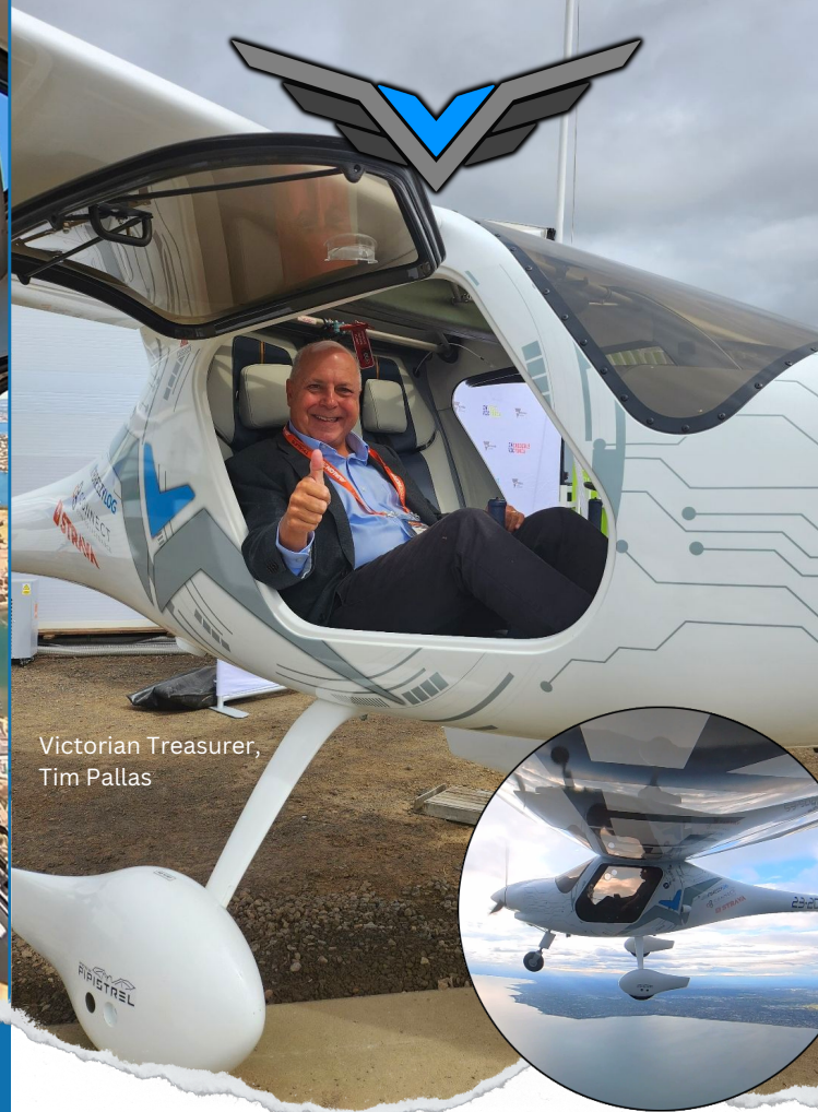
Victorian Treasurer, Tim Pallas

There are less than 300 electric planes operating in the entire world, so flying in one is a very unique experience! The electric trial flight is a great first exposure to electric sports aviation. You will be on the controls with the instructor at your chosen electric enabled flight school as you feel the power of flight.